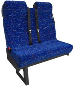
ZTZY 3061 (2/3 seat)